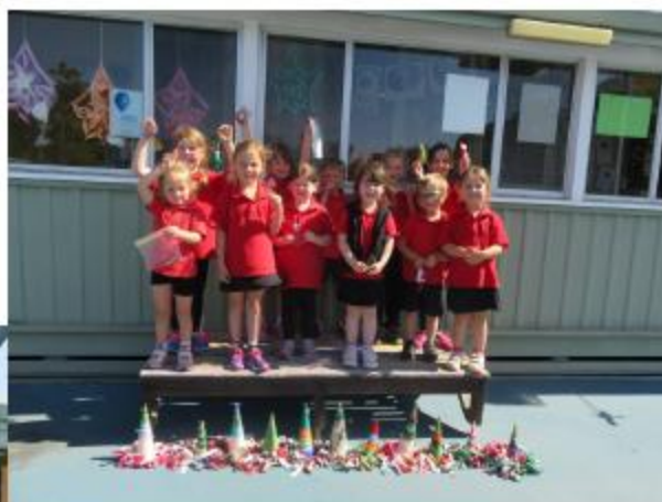
Above: The Echidna students.