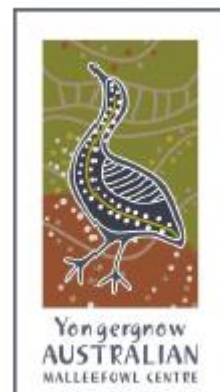
Spud – Yongergnow's first captive-bred Malleefowl.