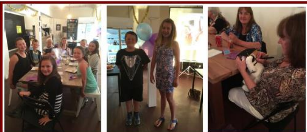
Above: The Graduation Dinner