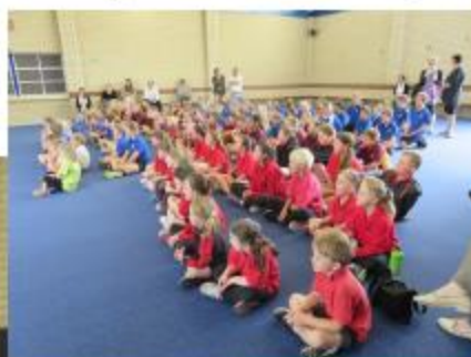
The entire audience.